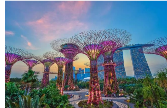
Gardens by the Bay